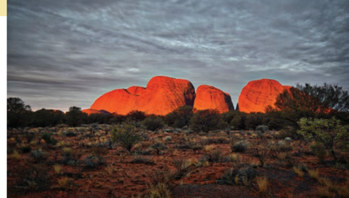
Kata Tjuta Sunrise