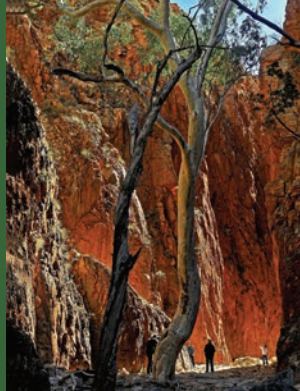
Standley Chasm Angkerle Atuatyete

Check with Parks for park access and all the facts sheets you need for safe, informative and enriched touring. www.nt.gov.au/parks