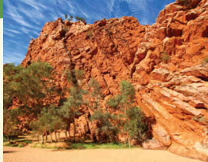
Yeperenye/Emily Gap Nature Park

TREPghINA GORGE NATURE PARK is home of the largest ghost gum ( Corymbia aparrerinja ) in Australia, this park offers a variety of short and experienced walks. With birds and other wildlife frequent visitors, the sheer quartzite cliffs and River Red Gum lined watercourses, this is a wonderful photo opportunity.