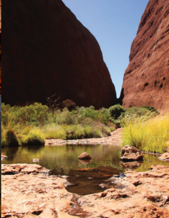
Kata Tjuta Walpa Gorge Walk