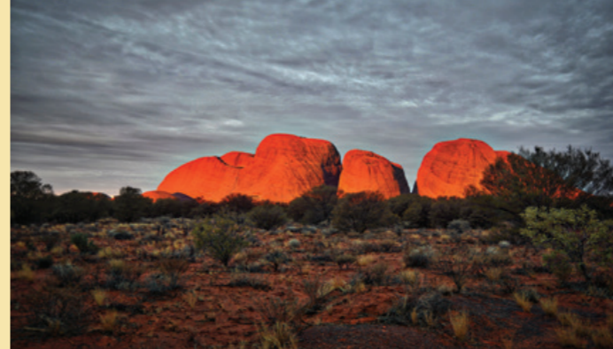
Kata Tjuta Sunrise