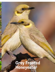
Grey Fronted Honeyeater