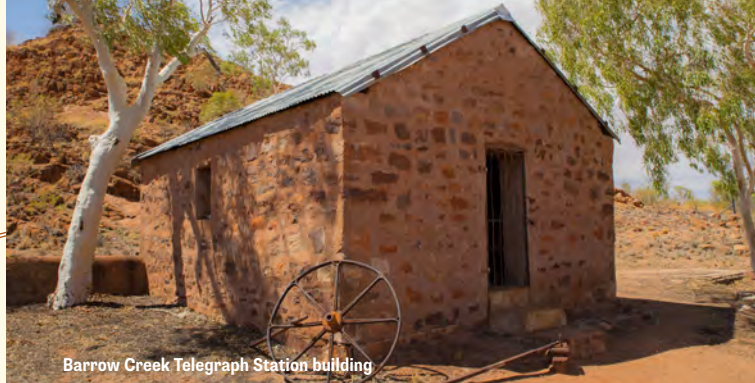
Barrow Creek Telegraph Station building