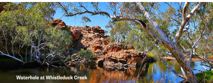
Waterhole at Whistleduck Creek

Discover European heritage sites from early pastoral and mining days. This is an ecologically significant & diverse area and can include the blackfooted rock wallaby, emu and the Australian Bustard, an unusual ground bird called a 'bush turkey' by Aboriginal people. Hundreds of waterbirds flock here to the sheltered gorges and permanent waterholes that are also full of several species of fish. Fees apply.