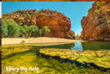
Ellery Big Hole