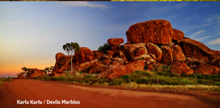
Karlu Karlu / Devils Marbles