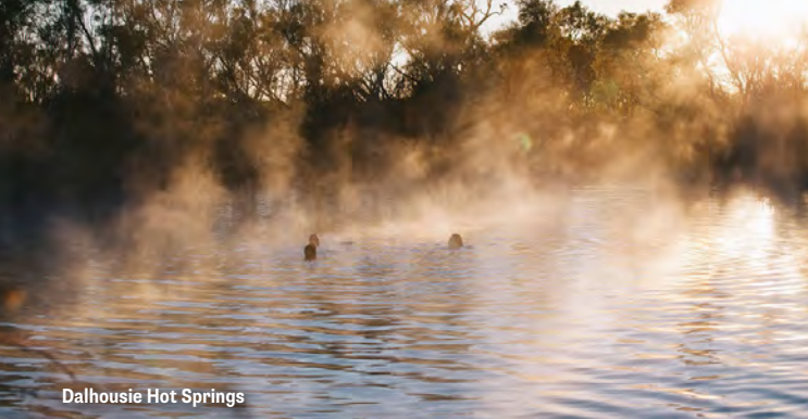
Dalhousie Hot Springs