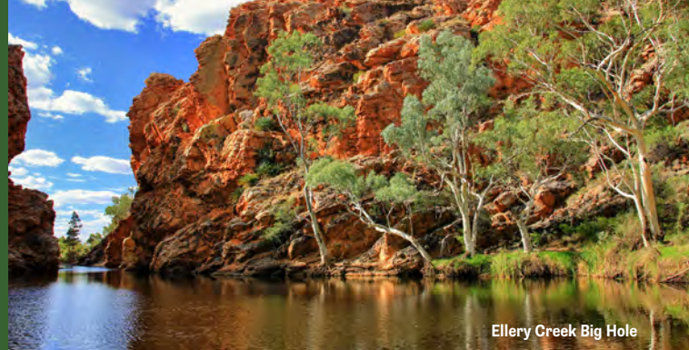
Ellery Creek Big Hole

Uncover more than just the 'icons'. THE RED CENTRE WAY not only offers a journey of adventure, it allows you to pack in as much, or as little, as you like. Take a one way journey from Alice Springs to Uluru or vice versa, via tour bus/guide, self drive or hire vehicle. Explore further with a 'loop' on the Mereenie Road if you have a 4WD, or enjoy a day trip from Alice Springs to parts of this adventure drive.