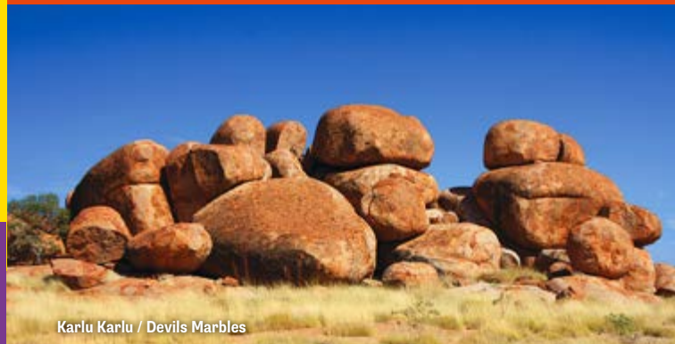
Karlu Karlu / Devils Marbles